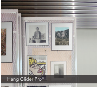
Hang Glider Pro®