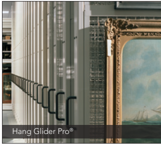
Hang Glider Pro®