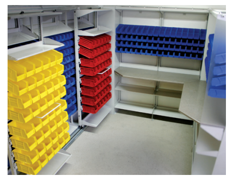
FrameWRX® Storage Systems The unique versatility of our modular FrameWRX Storage System brings unlimited storage flexibility to prison workshops, medical and activity areas. Custom tailor the system to your needs with infinite combinations of bins, trays, pegs and even built-in work surfaces.