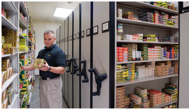
High-Density Mobile Storage (HDMS) Systems A mechanical-assist HDMS System stores virtually every kind of ammunition or lab supplies known. This unit features eight-inch-deep custom shelves, versus traditional shelf sizes, to conserve space.