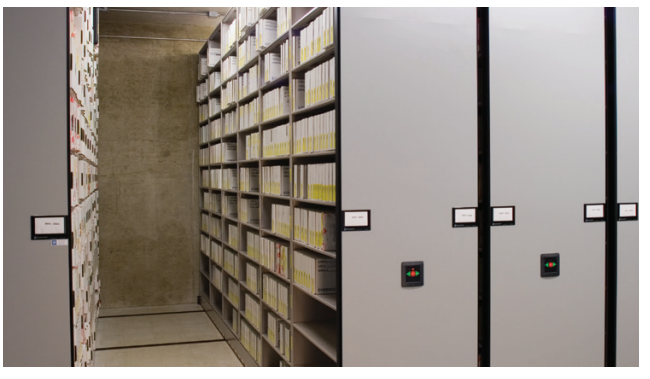
High-Density Mobile Storage (HDMS) Systems Once evidence is logged, Spacesaver HDMS Systems help maintain its integrity indefinitely.