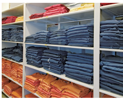
General Supply & Bulk Item Storage Uniforms, linens, sports equipment, bulk food and paper products, and much more can be stored easily and efficiently on rugged Spacesaver shelving systems.