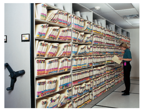
Inmate Files and Records Storage From active and inactive inmate classification records to medical files, Spacesaver HDMS Systems and Rotary Storage Systems (not pictured) help you keep pace with a growing glut of paperwork – in just a fraction of the space of conventional drawer filing systems.