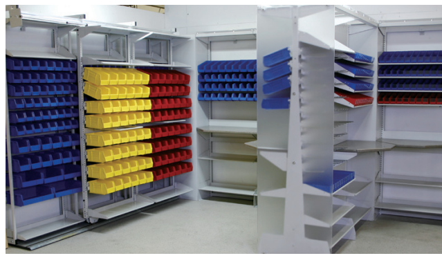
FrameWRX® Storage Systems Hang bins, trays and pegs on our modular FrameWRX Storage System's innovative rail system to maximize storage of a wide variety of evidence-processing supplies. With the flexibility to adapt to changing needs quickly and easily, FrameWRX Storage System provides highly customizable storage.